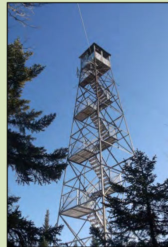
Goodnow Mountain Fire Tower & Trail Brochure 2003

On September 27 th , 2003 , thirteen Colvin Crew members and guests - met at the Adirondack Visitors Center in Newcomb, N. Y.