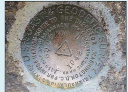
U.S.C. & G.S. Station Disc "GOODNOW" 1943