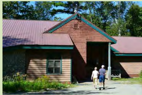
Adirondack Visitors Center Newcomb, N. Y.