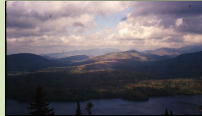
↑ Views from the Goodnow Mountain Fire Tower over Rich Lake to the High Peaks - September 27, 2003 ↗