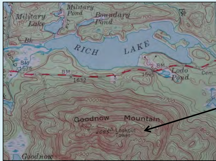
c. 1970's U.S.C. & G.S. topo map – showing the trail up Goodnow Mtn., the "Lookout Tower", and U.S.C. & G.S. Sta. "GOODNOW" 1942