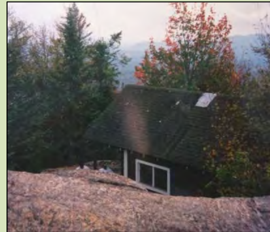
The restored Fire Tower Observer's Cabin on Goodnow Mountain's summit. 2003