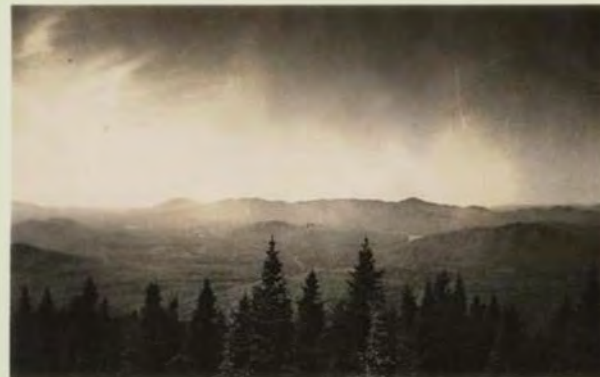
Goodnow Mountain from Mt. Van de Whacker