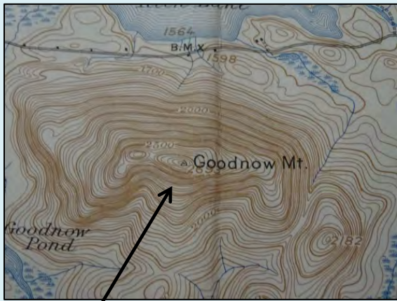
c. 1900 U.S.C. & G.S. Topo Map showing the Colvin Bolt No. 83 on Goodnow Mountain – just south of Rich Lake