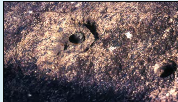
Drill Holes of the Adirondack Survey's Station Bolt No. 83 (top left), and the U.S.G.S. "Plug" Bolt (D.H. - lower right)